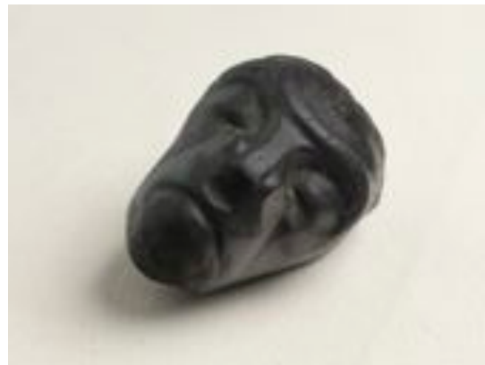
Image: Jackson Pollock, Untitled , 1930–3, Stone, 4.25 x 3 x 2.75 in (10.75 x 7.6 x 7 cm)