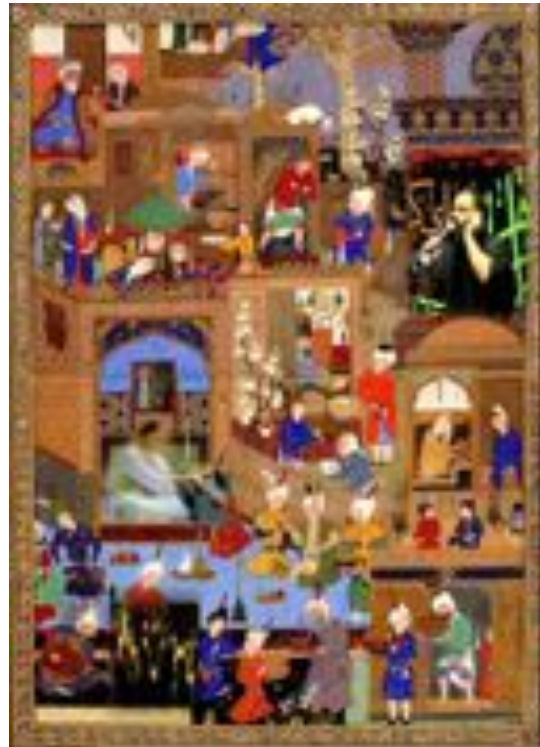
Image: Shoja Azari, Untitled (still) , 2012, Video projection on blank canvas, Dimensions variable